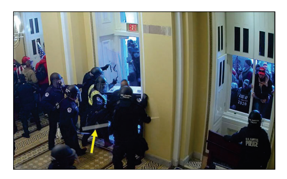
PVC pipe after it is thrown at officers through open door