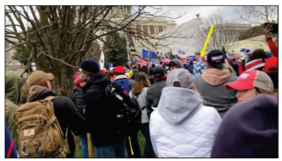
AYALA running forward through crowd after police line breaks

18. In a video posted to Parler on or shortly after January 6, 2021, AYALA is depicted climbing police barriers, which were moved by rioters to access to the Upper West Terrace. According to the ProPublica site dedicated to the Capitol Riot, the footage was taken at approximately 2:16 p.m.